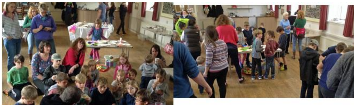
Good Friday & Easter Crafts April 14 th 2017

Well, what an afternoon! 21 children and 16 adults took part in craft activities together. It was wonderful to see both young and old get stuck into, making, painting and sticking. Much glitter was used to decorate a large cross for display in the church. The glitter, showing the light and sparkle that Jesus brought into our lives, on Easter Sunday, when he rose from the dead. I found out very recently that the hollow egg symbolises the empty tomb. What a lovely connection. Cards we made, highlighted the colourful joy of Easter Sunday and the plain and simple cross that Jesus sacrificed himself on for us. Thank you to all of you who came to join in, thank you to the wonderful band of volunteers who made tea, poured squash and helped tidy up afterwards.