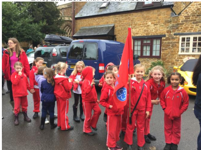
Ready for the Off!